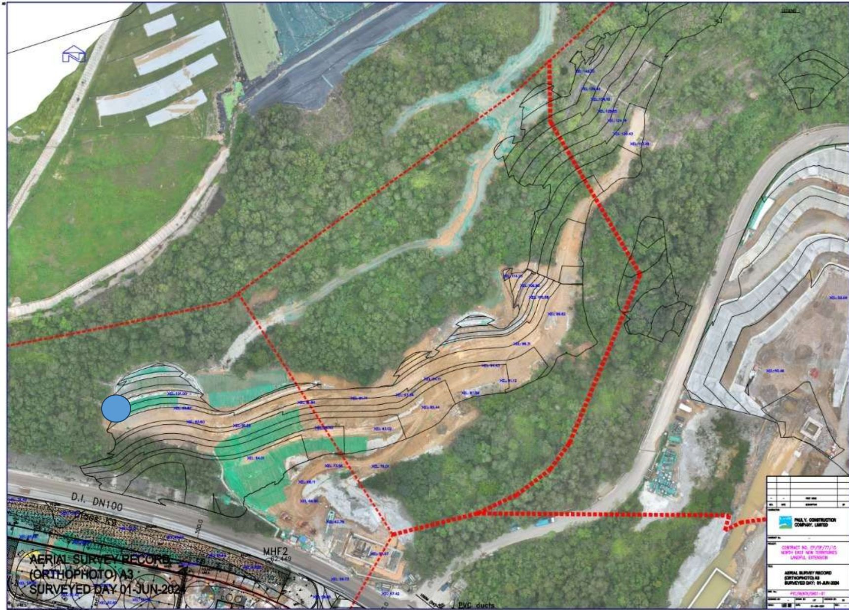
Figure 3 Landfill Gas Monitoring Locations

Gas Monitoring Point ● Monitoring Frequency: 2 times per day